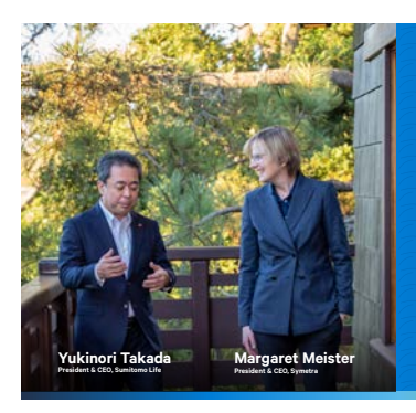
"We really do have the best of both worlds. We have a great local leadership team, and we have the global support of Sumitomo Life there to stand with us along the way."

Together, Sumitomo Life and Symetra believe that profitable growth starts with putting customers first. Our partnership will help ensure that both companies serve more customers, in more places across the globe, for many years to come.